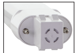
S28725-S28729 GX23 Base