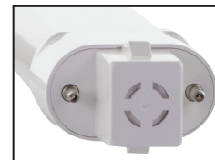
S18400-S18404 G23 Base