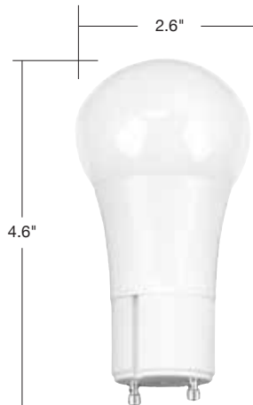
10W Omni-Directional A-Lamp